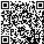
Fosi Audio Product's User Manual

After-sale Service and Technical Support Email: support@fosiaudio.com